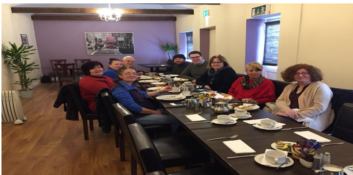
A treat of breakfast in Dowling's in Prosperous after a recent Parents Course!